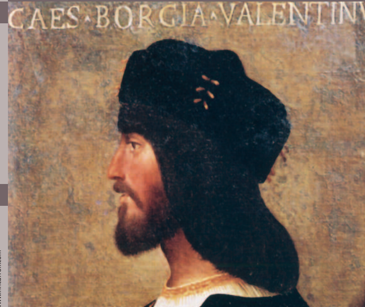
Césare Borgia, after Bartolomeo Veneto, c. 1510, National Museum of Palazzo Venezia, Rome