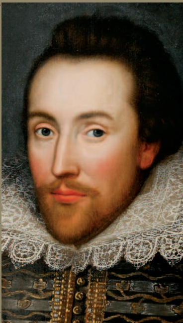
Cobbe portrait of William Shakespeare (disputed), c. 1610, artist unknown, Hatchlands Park, Surrey

Marines' Memorial Theatre 609 Sutter Street, San Francisco Tickets: 415.392.4400 or Cityboxoffice.com