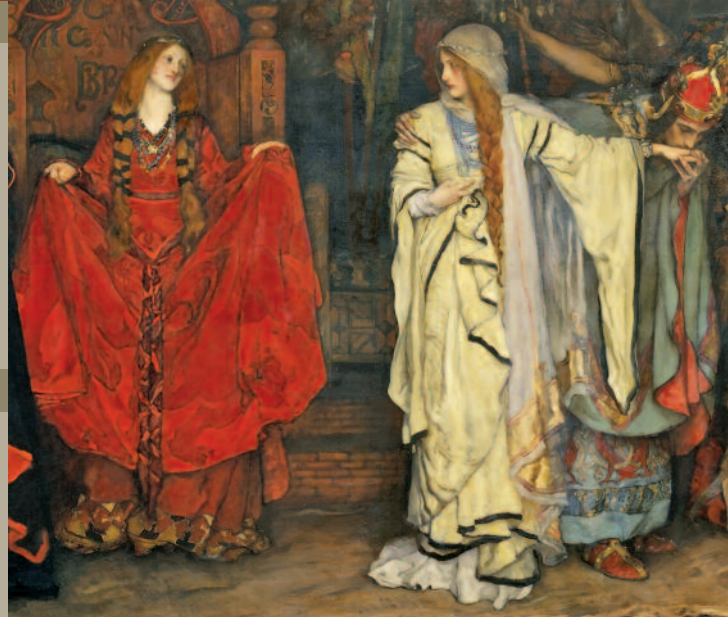
Detail from King Lear, Act I, Scene I (Cordelia's Farewell) by Edwin Austin Abbey, 1898, Metropolitan Museum of Art