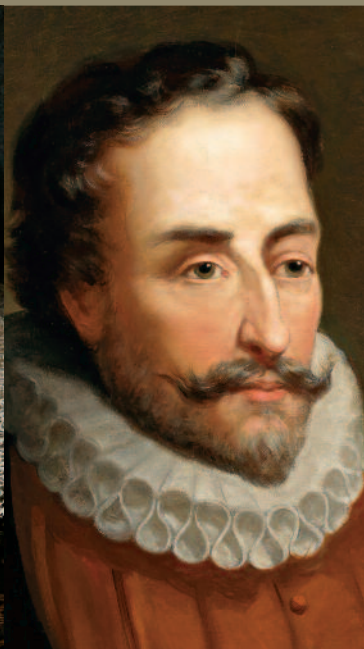
19th-century portrait of Miguel de Cervantes Saavedra by Eduardo Balaca, Prado Museum

For more information, visit humanitieswest.org